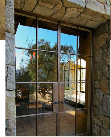
BRONZE DOORS & WINDOWS