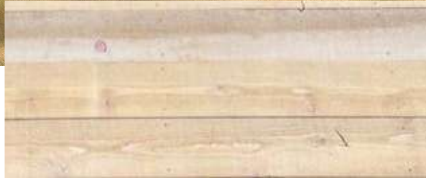
WEATHERED CEDAR SIDING