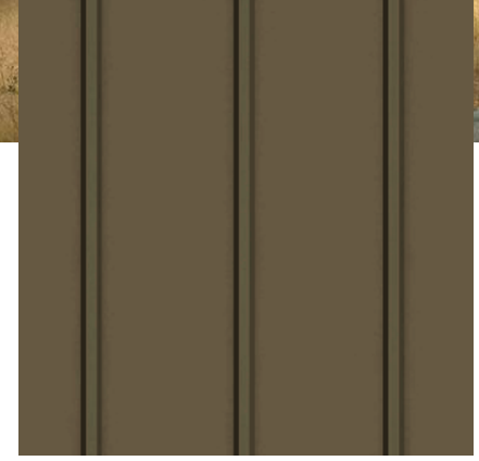
BRONZE STANDING SEAM METAL ROOF